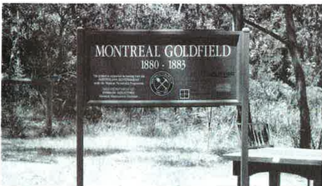
Montreal Goldfield, Sapphire Coast geoheritage journey, Australia's Coastal Wilderness National Landscape, Bermagui NSW

Geotrails have been developed within the 'Australia's Coastal Wilderness' National Landscape located along the Southern NSW coastline extending into Victoria — see http://www.sapphirecoast.com.au/tales-trails/geological-trail/ .