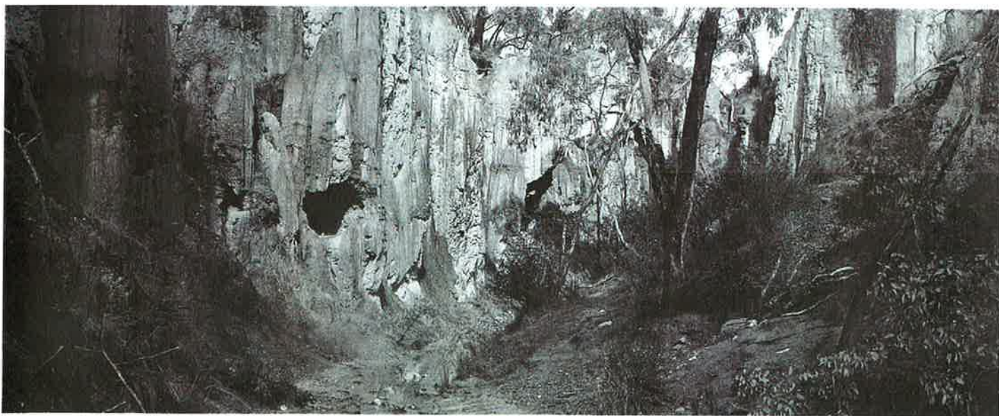
Chinese alluvial gold diggings, Hill End Historic Site, NSW.

The interpretation of geotrails can be assisted through the production of hard-copy maps. The first edition of the Geotourism Map of NSW was published by Cartoscope Pty Ltd in 2013 with the valued technical input of McElroy Bryan Geological Services (and supported by the GSA). The company has now decided to update the map's information. The first edition of this state map was an outstanding success and very few of the 100 000 printed copies remain. In particular, this double-sided A0-size map has proved to be a very popular handout state-wide through regional visitor centres, educational institutions, geoscience organisations and with the wider community.